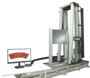
Bonding Inspection Contact Ultrasonic System