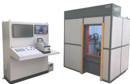
Casting Inspection X-Ray System