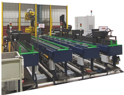
Bearing Inspection Immersion Ultrasonic System

When delivering these solutions to customers, we do the requirement gathering, inspection modality selection, design & build custom hardware and software, integration and installation for production.