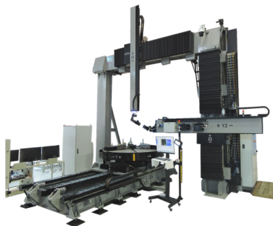
Bonding Inspection Air Coupled Ultrasonic System